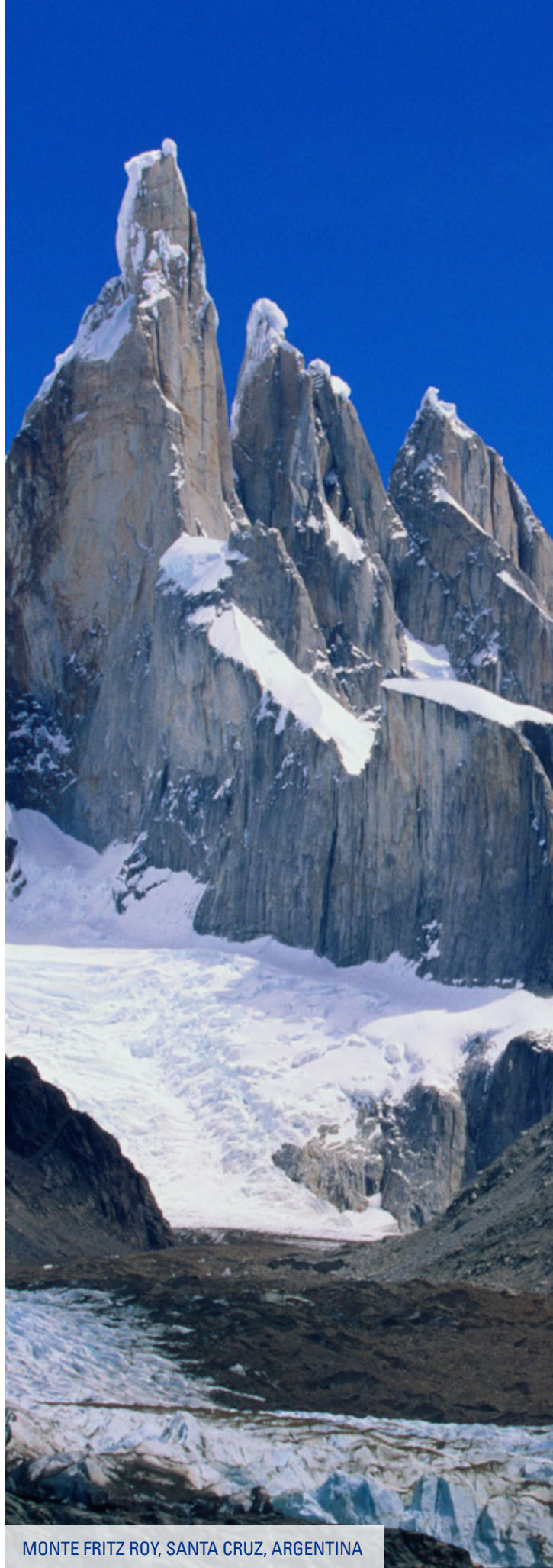
MONTE FITZ ROY, SANTA CRUZ, ARGENTINA

Argentina's wide range of climates and scenery make the country attractive for tourism. Varied landscapes include wide and beautiful beaches, the highest mountains in the Western Hemisphere, soft green hills in the central provinces, a wonderful lake region and paradises for skiing in the south and west. Argentina also offers an extensive network of protected areas –national parks– throughout the country.