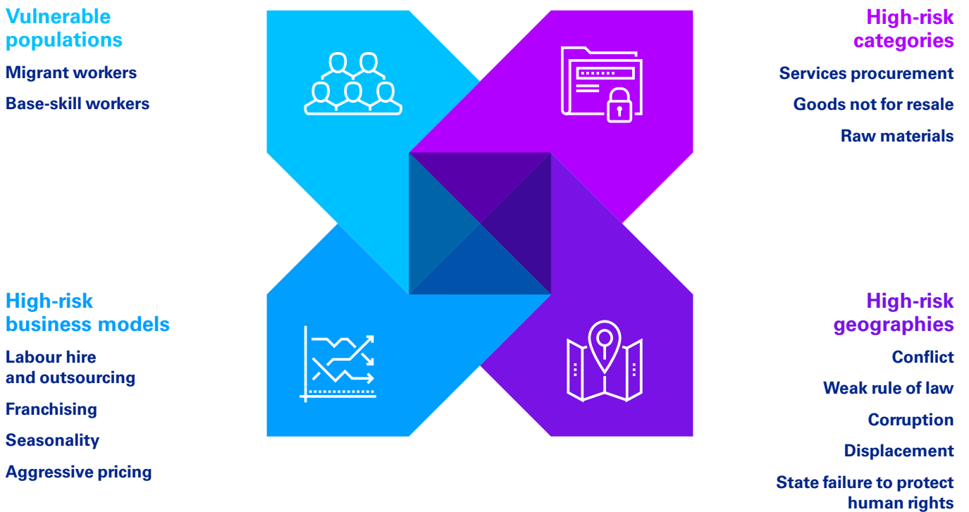
Figure 3: Key modern slavery risk factors

There are four key factors which elevate the risk of modern slavery: vulnerable populations, high-risk business models, high-risk categories, and high-risk geographies. Where multiple high-risk factors co-exist, there is a higher likelihood that actual harm is being experienced, and additional controls are required to ensure that risk does not become harm.