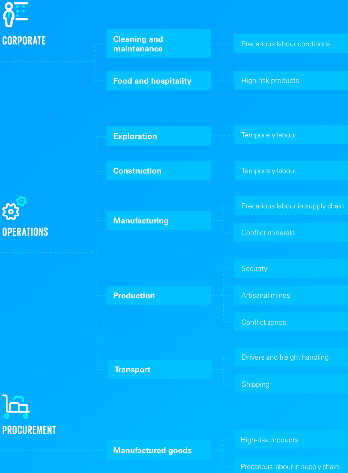
Figure 2: Areas in resources and energy where modern slavery risks are most likely to arise