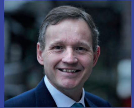
Antony Jenkins (UK)

“The board should positively champion the desired culture all the time. The behaviors board members exhibit set the tone for the whole organization. Every action you take will be acutely observed.”