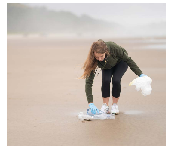
Get ready for a new level of ESG reporting