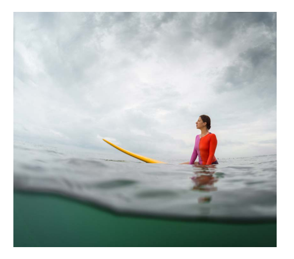
What does the CSRD mean for companies?