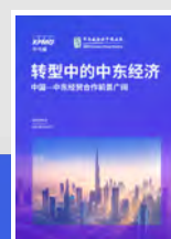
Report on China's Export Momentum and Corporate Confidence Index