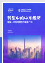
《转型中的中东经济 ——中国与中东经贸合作 前景广阔》