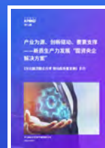
Deepening the Reform of State-Owned Assets and Enterprises to Promote High-Quality Development series