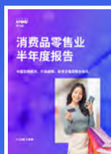
Semi-annual Report on the Consumer and Retail Sector in China