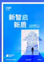
Trends from the Zhongguancun International Advanced Technology Competition