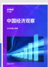
China Economic Monitor