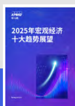
Top 10 Macroeconomic Trends in 2025