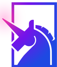
未来独角兽 Future Unicorn

KPMG China launched the "Future Unicorn" campaign, which is dedicated to exploring potential "unicorn" start-ups through a professional and fair platform. This initiative helps companies accelerate their development and pursue innovative breakthroughs, ultimately creating a strong innovation and technology ecosystem.