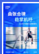
China Banking Survey Report 2025