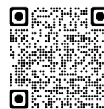
KPMG China 'Our Impact Plan' FY24

In 2025, KPMG China issued its fifth ESG report: 'Our Impact Plan' FY24.