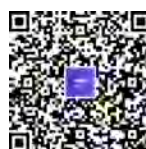
2024 KPMG Sector Insight Yearbook

With a forward-looking approach, we deliver first-hand insights into industry trends and create value for clients through professional collaboration. Access the KPMG Sector Insight Yearbook and specialised reports by scanning the QR code. Let us partner with you to navigate rapid change, embrace innovation, and shape a successful future together.