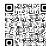
KPMG Sector Insight publications