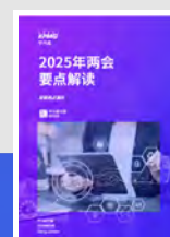
Interpretation of Highlights from the NPC and CPPCC Sessions