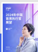
China CEO Outlook