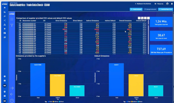
Delta analysis of total emissions reported and default values; deviations shown in amber/red.

In this step, the plausibility of the data provided is checked in the tool and a delta analysis of the total emissions reported and the default values is produced. You can verify the degree of deviation using a kind of traffic light system: An amber value indicates deviations of at least 10 per cent, while a red value indicates deviations of 50 per cent or more.