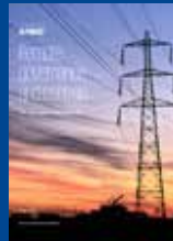
Remote governance and controls