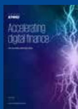
Accelerating digital finance