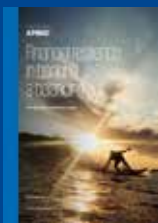
Financial resilience in banking: a balancing act