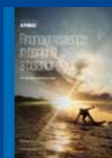
Financial resilience in banking: a balancing act