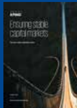
Ensuring stable capital markets