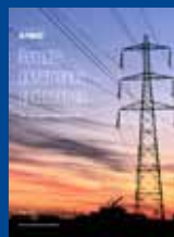
Remote governance and controls