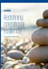
Redefining operational resilience