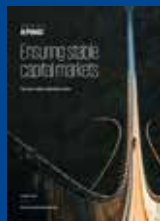
Ensuring stable capital markets