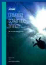
Delivering sustainable finance