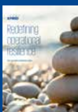
Redefining operational resilience