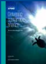
Delivering sustainable finance