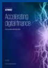
Accelerating digital finance