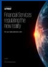
Financial services: regulating the new reality