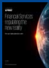
Financial services: regulating the new reality