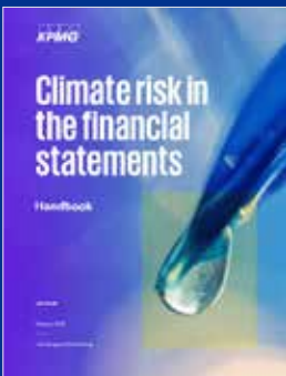
Climate risk in the financial statements – Handbook