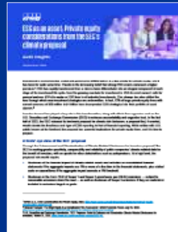
ESG as an asset: Private equity considerations from the SEC's climate proposal