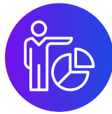
Private Client Practice