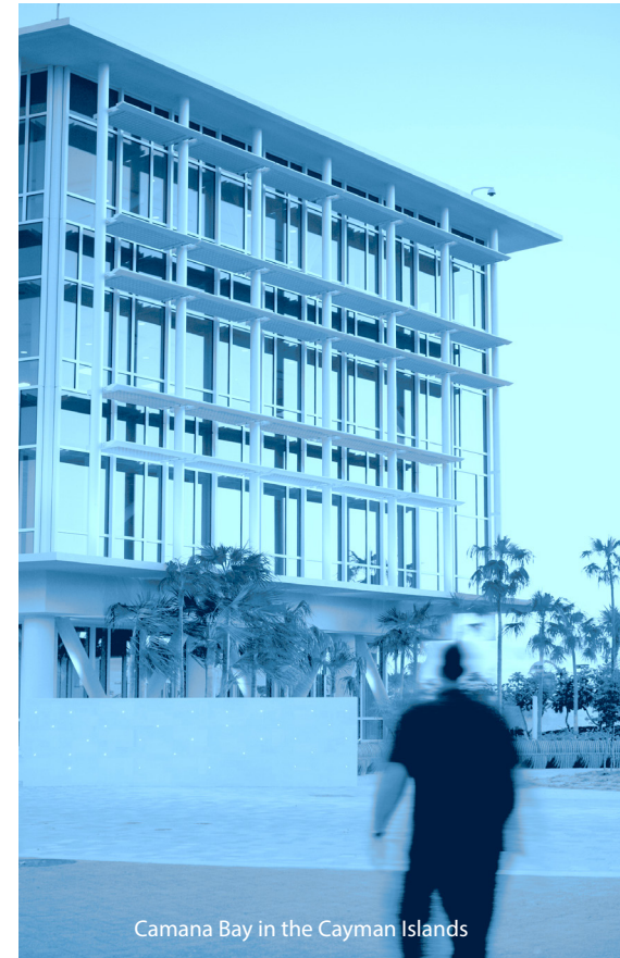
Camana Bay in the Cayman Islands

Given all of the above it is no wonder that the Cayman Islands was awarded with the "Offshore Domicile of the Year" at the 2015 US Captive Services Awards in Vermont, and why so many captives find the Cayman Islands the ideal place to domicile and do business.