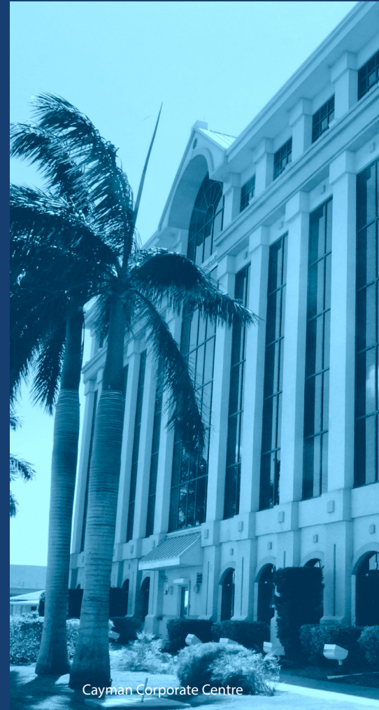
Cayman Corporate Centre

CIMA prides itself on being business-friendly and will provide valuable insight into the license application process.