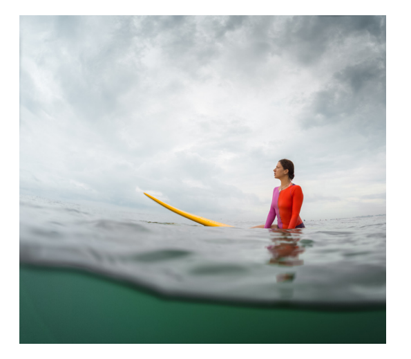
What does the CSRD mean for companies?