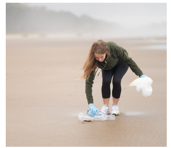
Get ready for a new level of ESG reporting