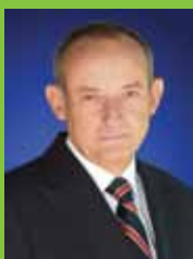
Yvo de Boer

Special Global Advisor KPMG Climate Change & Sustainability