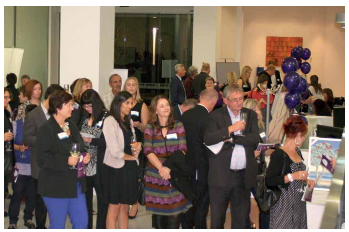
HELP charity auction at KPMG's Auckland premises