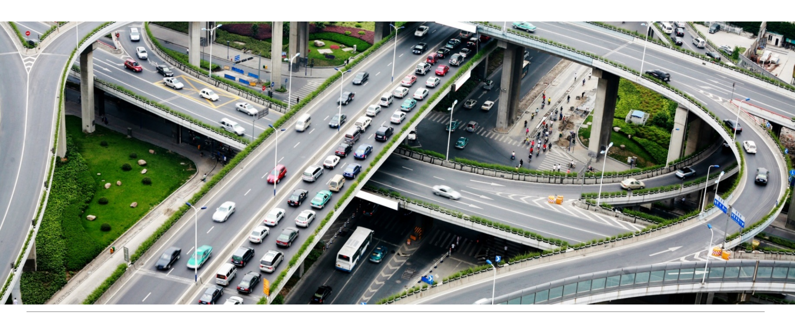
© 2015 KPMG, a Hong Kong partnership and a member firm of the KPMG network of independent member firms affiliated with KPMG International Cooperative ("KPMG International"), a Swiss entity. All rights reserved.

Most of the common observations above result from the responsible functions' lack of knowledge and experience, and these weaknesses can only be identified during real-life scenarios or a realistic crisis management drill. It is important that all parties responsible for managing a crisis are well trained so that they are prepared.