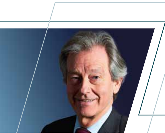
by Stephen Dorrell