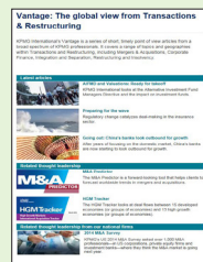
Vantage: The global view from Transactions & Restructuring