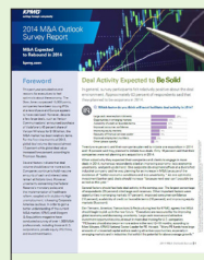
2014 M&A Outlook Survey