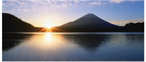
Presentation and disclosures