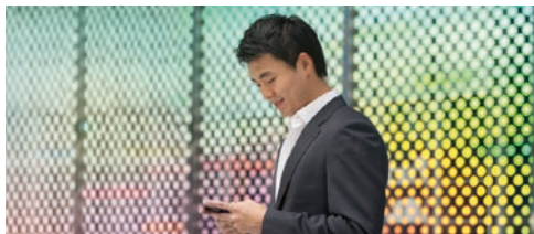
IFRS 15 for sectors