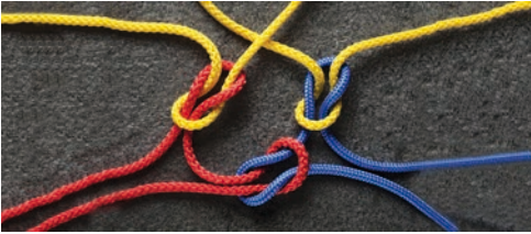
Business combinations and consolidation