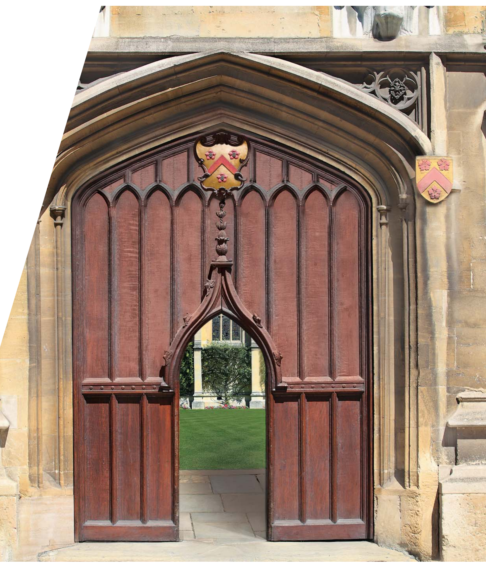
© 2013 KPMG International Cooperative ("KPMG International"), a Swiss entity. Member firms of the KPMG network of independent firms are affiliated with KPMG International. KPMG International provides no client services. All rights reserved.