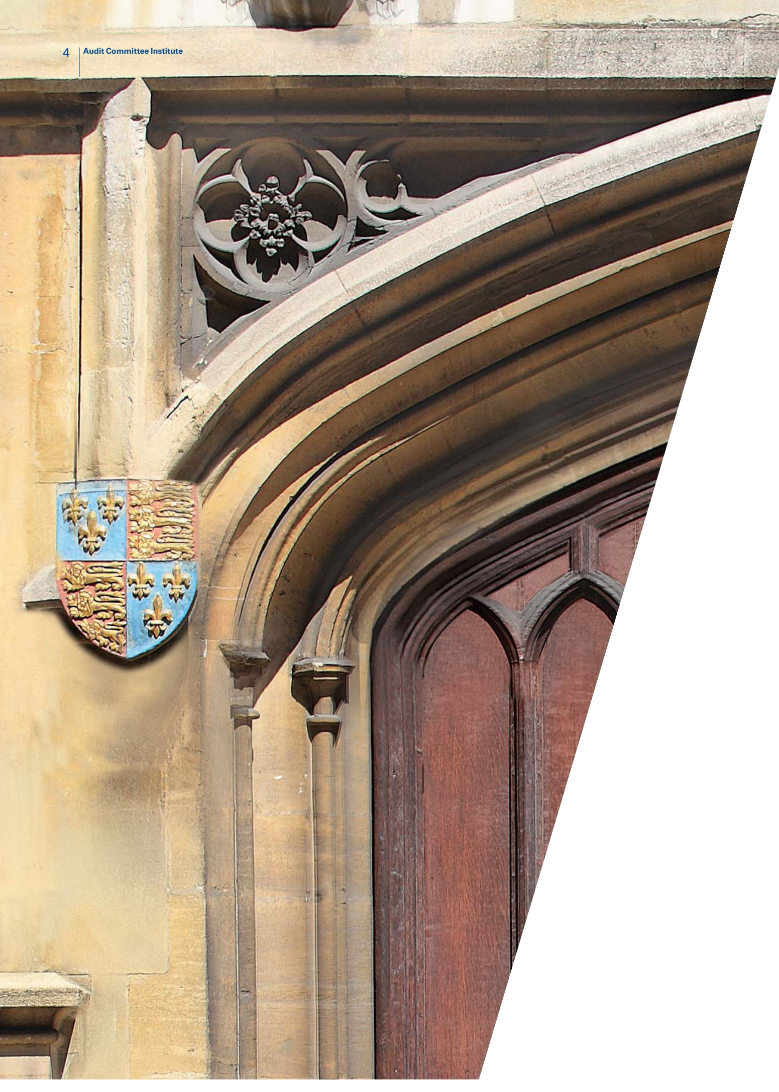
© 2013 KPMG International Cooperative ("KPMG International"), a Swiss entity. Member firms of the KPMG network of independent firms are affiliated with KPMG International. KPMG International provides no client services. All rights reserved.