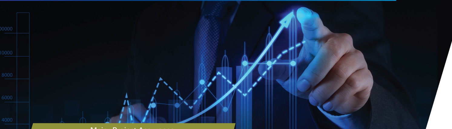
Major Project Assurance

Are your Capital Projects or large IT Projects running on time and within budget? Scope creep, delays, and non-performing contractors almost certainly leading to over-expenditure or late delivery? Are the relevant areas being assured and audited? We can assist!