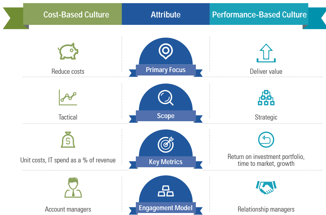
Figure 1: Cost-based versus Performance-based Culture

We believe value starts with a fact-based conversation on the total cost and effectiveness of the entire IT portfolio. Applying the principles of Technology Business Management (TBM) can change the perception of IT to that of a dynamic partner by changing the dialogue from one about commoditized unit costs to one of strategic growth, investments, and market capture. It happens when we make the shift from a cost-based culture to a performance-based culture.