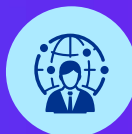
KPMG Clara Client Collaboration

KPMG has an innovative, totally integrated, scalable and cloud-based audit platform. It enables to apply an improved audit methodology through a data-based workflow, which provides our teams with the ability to be more effective by unlocking the power of data to perform high-quality audits.