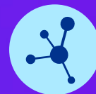
KPMG Clara Workflow