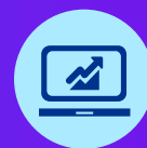
Conversion and convergence services