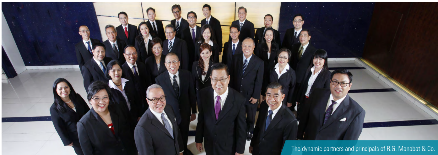
The dynamic partners and principals of R.G. Manabat & Co.