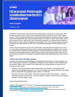
ESG as an asset: Private equity considerations from the SEC's climate proposal