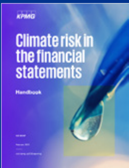
Climate risk in the financial statements – Handbook