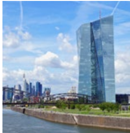
Zeroing in on key risks