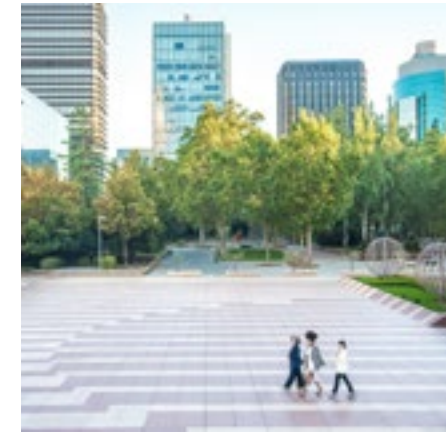
Final thoughts — the time for talk is over