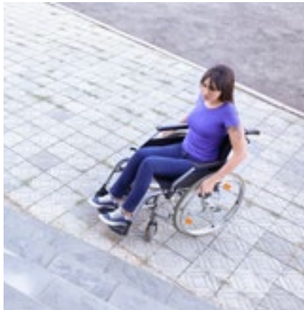
Barriers to progress