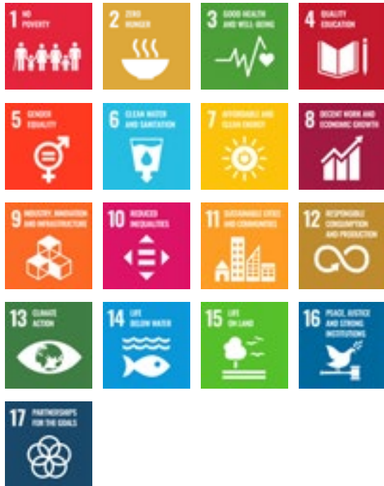
Figure 1: Sustainable Development Goals

Unfortunately, as this report highlights, systemic roadblocks continue to impede progress and threaten our prospects for success. Is there cause for alarm? KPMG professionals believe so and they are not alone.