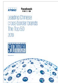
Leading Chinese cross-border brands: The Top 50, 2019