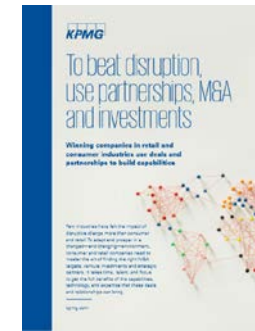
To beat disruption, use partnerships, M&A and investments