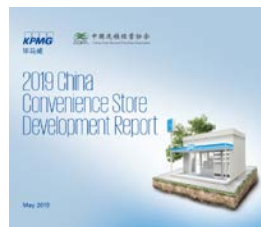
2019 China Convenience Store Development Report