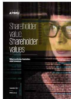
Shareholder value: What motivates Australian retail investors