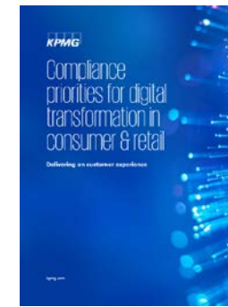
Compliance priorities for digital transformation in consumer & retail