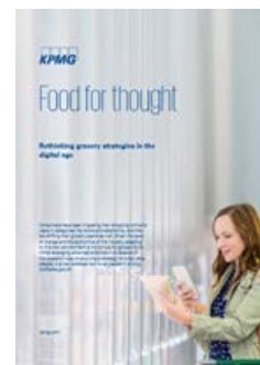
Food for Thought