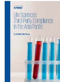
Life Sciences Third-Party Compliance in the Asia Pacific