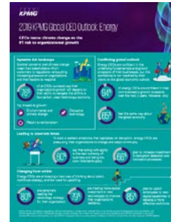
2019 KPMG Global CEO Outlook: Energy

The following are several recent examples.