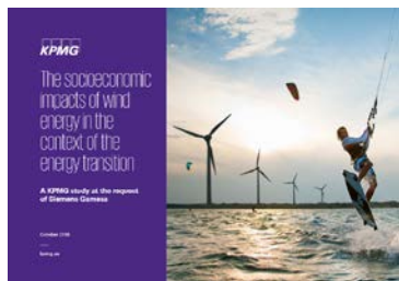
The socioeconomic impacts of wind energy in the context of the energy transition