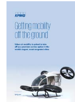
Getting mobility Off the ground