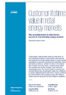
Customer lifetime value in retail energy Markets