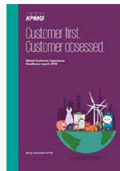
Customer first. Customer obsessed.