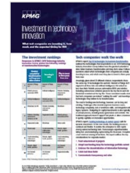
Investment in Technology innovation