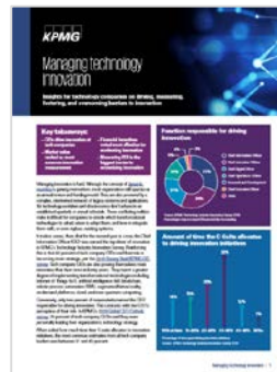
Managing technology innovation