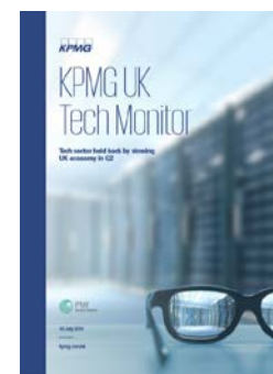
KPMG UK Tech Monitor Q3 edition