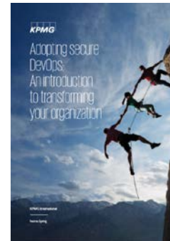
Adopting secure DevOps: An introduction to transforming your organization.