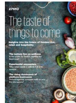
The taste of things to come