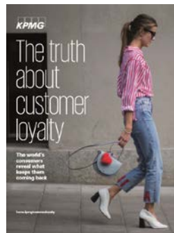
The truth about customer loyalty