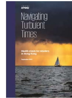
Navigating Turbulent Times