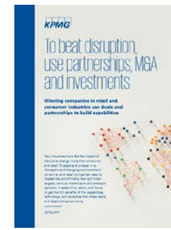
To beat disruption, use partnerships, M&A and investments