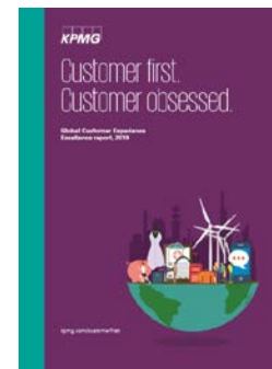
Customer first. Customer obsessed.