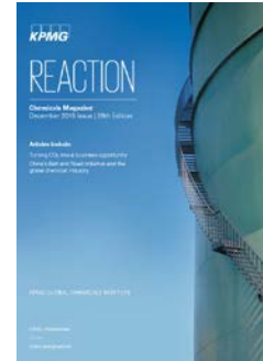
REACTION Magazine – December 2019

The following are several recent examples.