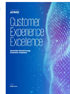
Customer Experience Excellence in the Australian Retail Energy Sector 2019