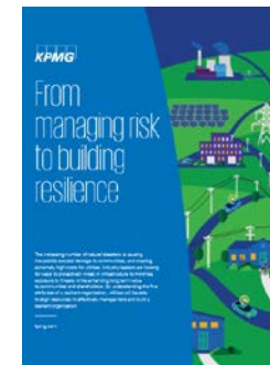
Managing risk and building resilience