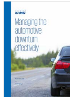
Managing the automotive downturn effectively