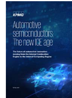
Automotive Semiconductors: The new ICE age