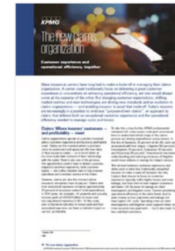
The new claims organization