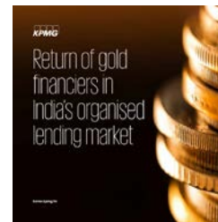
Return of gold financiers in India's organized lending market