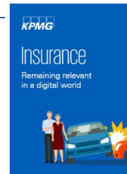
Customer insights – Insurance: Remaining relevant in a digital world