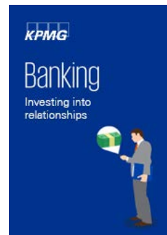
Customer insights – Banking: Investing into relationships