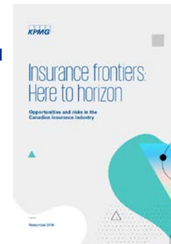
Insurance frontiers: Here to horizon