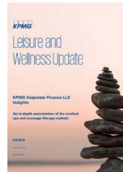
Leisure and wellness update