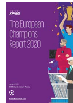
The European Champions Report 2020