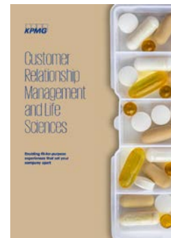
Customer Relationship Management and Life Sciences