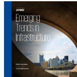
Emerging Trends in Infrastructure 2020

The following are several recent examples.