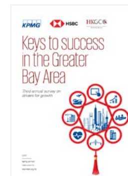
Keys to success in the Greater Bay Area