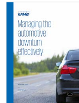
Managing the automotive downturn effectively