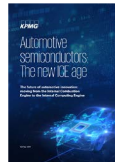
Automotive Semiconductors: The new ICE age