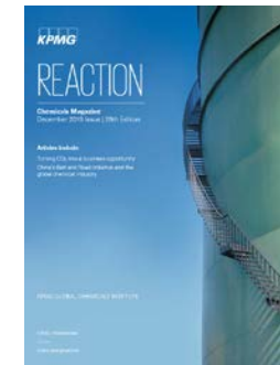
REACTION Magazine – December 2019