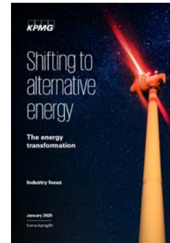
Shifting to alternative energy

The following are several recent examples.