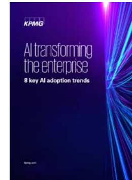
AI transforming the enterprise