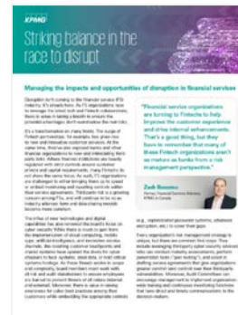
Striking Balance in the Race to Disrupt