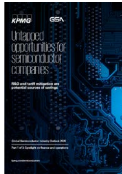
Untapped opportunities for semiconductor companies

The following are several recent examples.