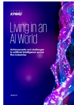
Living in an AI World