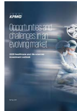
2020 healthcare and life sciences investment outlook