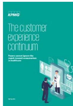
The customer experience continuum