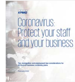
Coronavirus: Protect your staff and your business