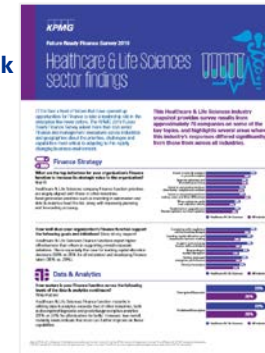
Future Ready Finance Survey 2019: Healthcare & Life Sciences sector findings