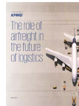
The role of airfreight in the future of logistics