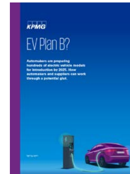
EV plan B?