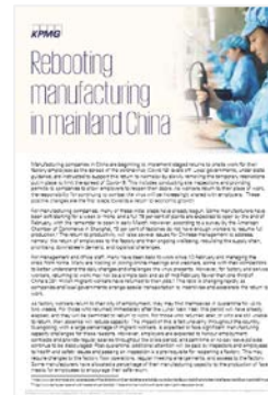
Rebooting manufacturing in mainland China