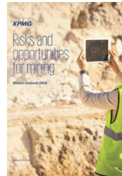
2020 Global Mining Survey Report

The following are several recent examples.