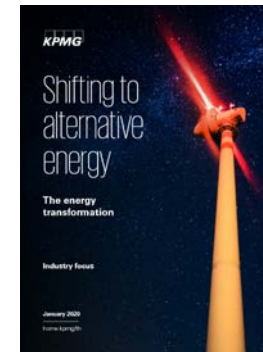
Shifting to alternative energy