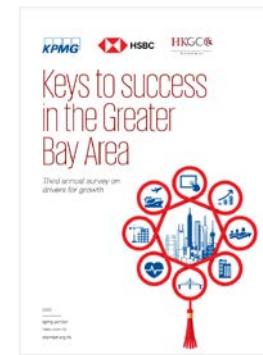
Keys to success in the Greater Bay Area