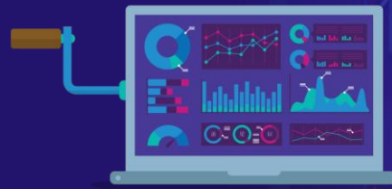
ERP Solution connected with communication channel

การใช้ Digital แบบ ประยุกต์ ในหลาย ส่วนเพื่อเพิ่ม ประสิทธิภาพการ ทำงานใน องค์กรรวม ขององค์กร