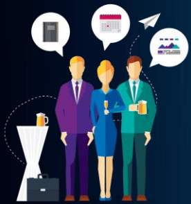
Collaboration tools and Social Network

การใช้ Digital ขั้นพื้นฐาน เพื่อเพิ่ม ความ คล่องตัว ใน การทำงาน และ สื่อสารกับลูกค้าใน บางส่วนงาน