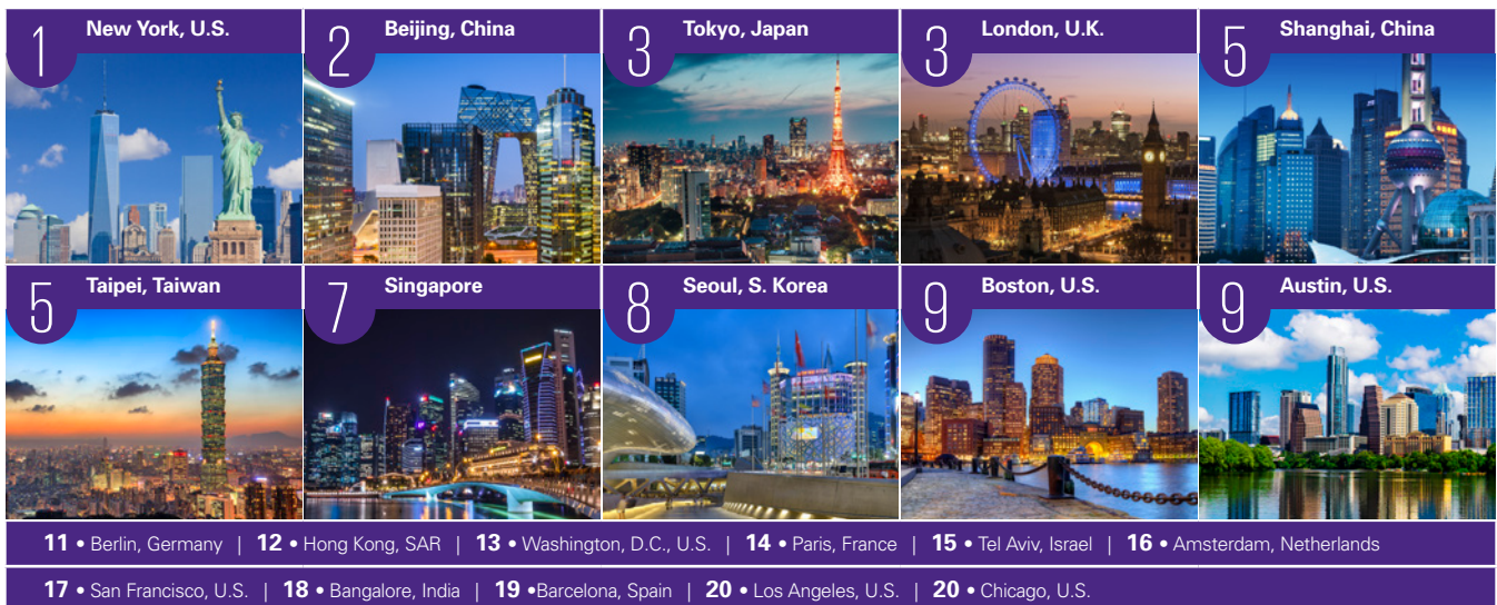
Partial list of cities shown. Source: KPMG Technology Industry Innovation Survey 2019