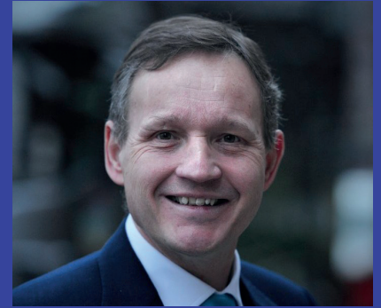
Antony Jenkins (UK)

“The board should positively champion the desired culture all the time. The behaviors board members exhibit set the tone for the whole organization. Every action you take will be acutely observed.”