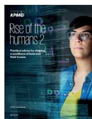
'Rise of the Humans' (2017).

Powered Enterprise is the culmination of sustained investment and decades of experience in the solving of real-world business challenges. The investment and the learning continue. Ongoing collaboration with our clients and key industry players helps to align advances in technology with the evolving needs of the modern business. It's not just about access to technical upgrades or value-adding services, but shaping your own future.