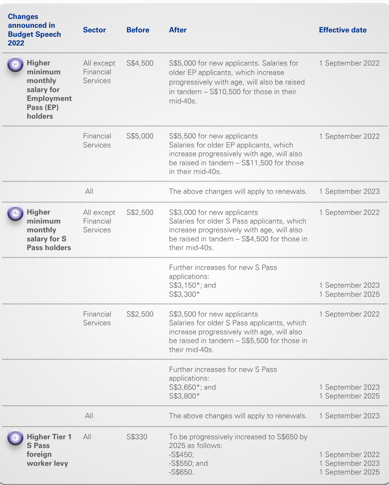
TABLE 1: Updates to minimum qualifying salary and foreign worker levy