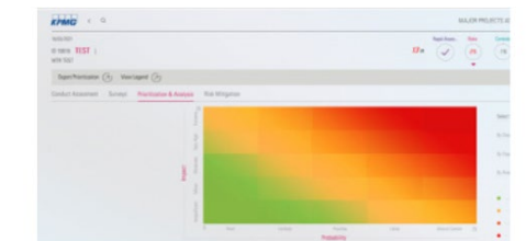
Risk prioritisation and automated heat map generation