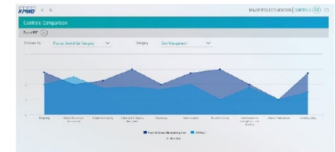
Benchmarking ratings and practices across projects