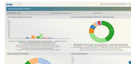
Analytics on project repository (Includes over 300 global projects)