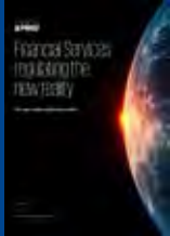
Financial services: regulating the new reality