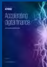
Accelerating digital finance