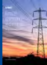
Remote governance and controls