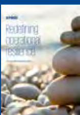
Redefining operational resilience