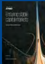
Ensuring stable capital markets