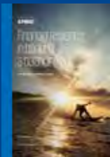
Financial resilience in banking: a balancing act