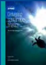
Delivering sustainable finance